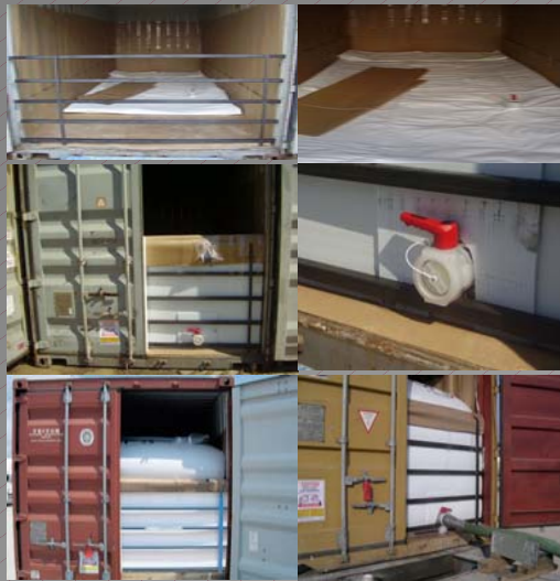
Bulk Liquid Transport Liners