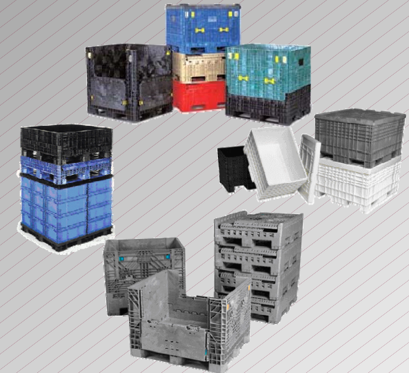
Solid Wall & Collapsible Standard Containers