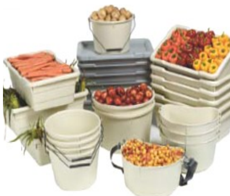
Pails & Lugs