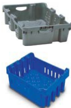
Agriculture Hand-Held Containers