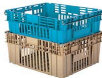
Meat, Poultry, Seafood Chill Containers