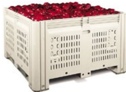
Ventilated Fixed Wall Containers