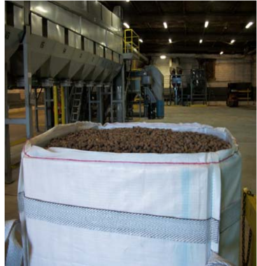
PECAN CONTAINER FILLED