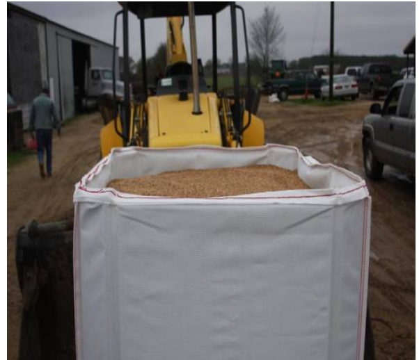
CORN CONTAINER FILLED