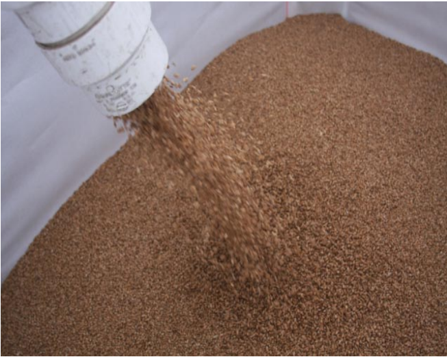
CORN KERNEL TOP FILL