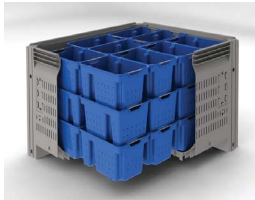
TOTES INSIDE CONTAINER