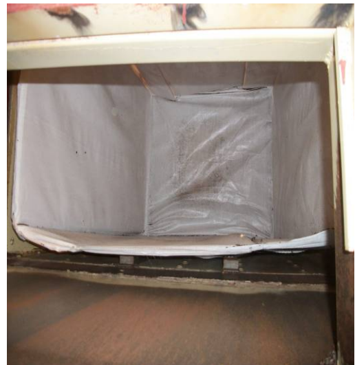
CONTAINER AFTER DUMPING