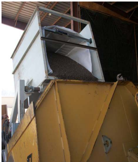
COTTON SEED ROTATIONAL DUMPING