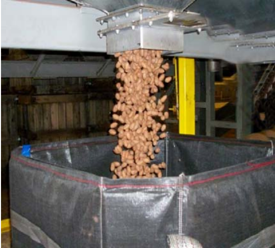
PECAN CONTAINER TOP FILL