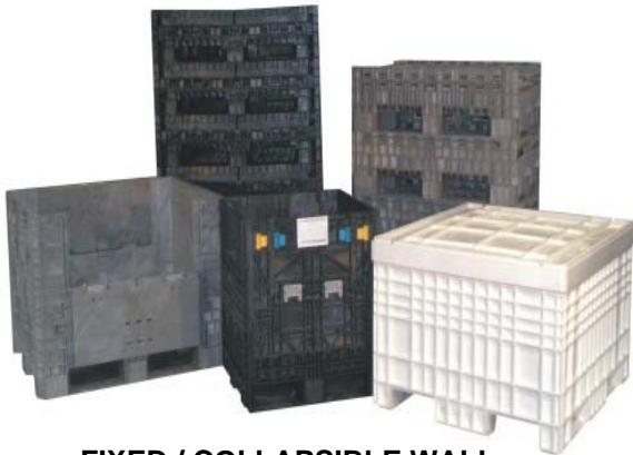
FIXED / COLLAPSIBLE WALL CONTAINERS