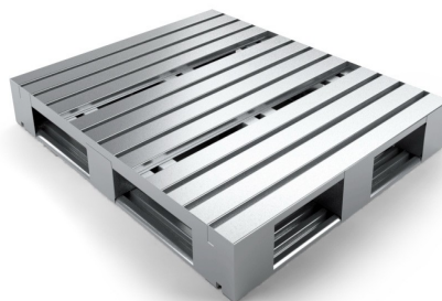
Aluminum / Steel